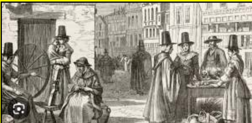
The historic Welsh settlement of Patagonia, Argentina.